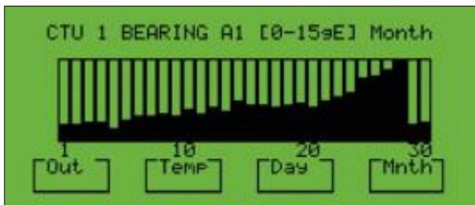
Typical SKF ST-1240 lubrication control system