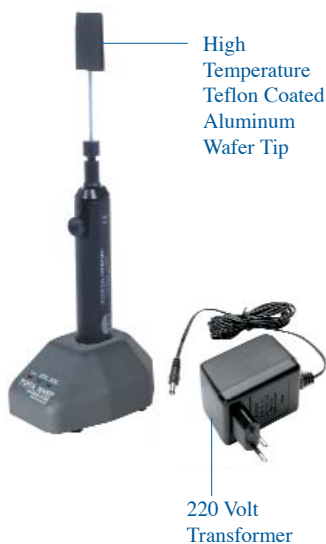
PORTA-WAND 220 Volt Kit

High Temperature Teflon Coated Aluminum Wafer Tip