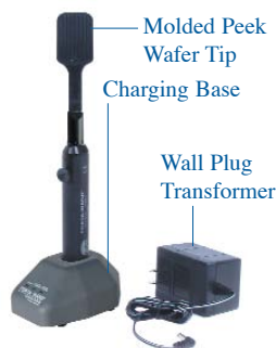
PORTA-WAND 3 Kit With