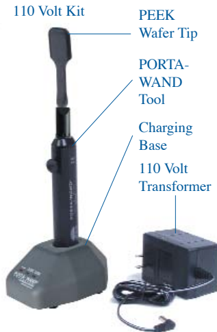
PORTA-WAND 110 Volt Kit

Every wafer wand is tested to insure compliance with Class 1 particle contamination requirements. These tools are a natural replacement for wafer tweezers. The interchangeable PEEK wafer tip will not damage the wafer like a wafer tweezer can.