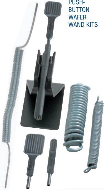
PUSH-BUTTON WAFER WAND