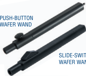
SLIDE-SWITCH WAFER WAND